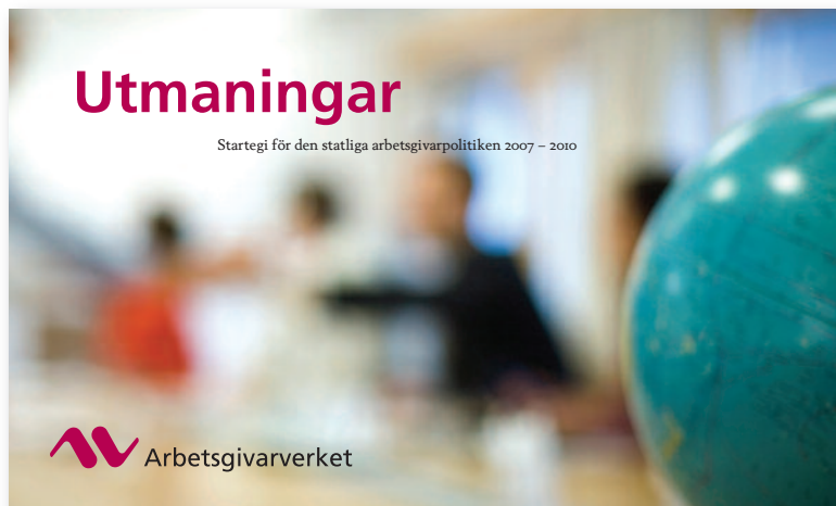
Challenges , Policy strategy for government employers 2007 – 2010 (Swedish Agency for Government Employers)